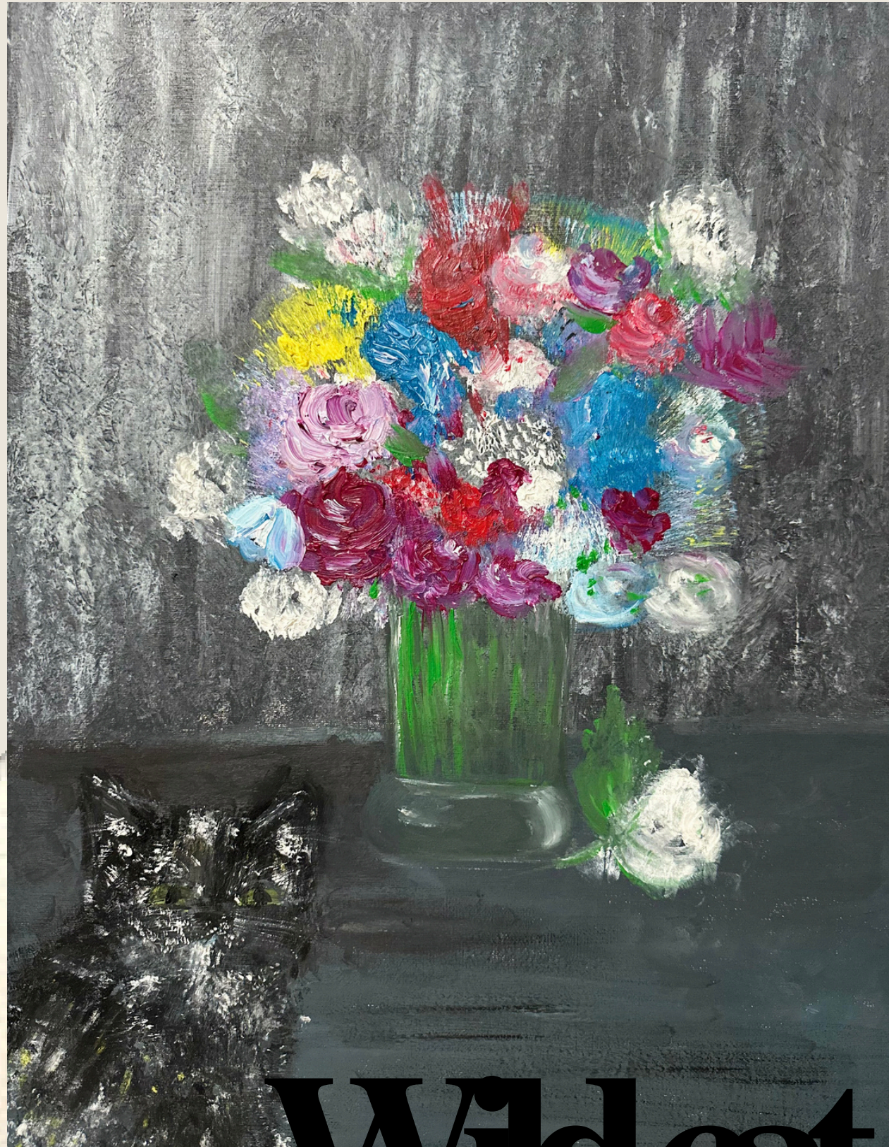
"Wild Cat, Wild Flowers" 60x45 Oil on Canvas

A burst of wild blooms defies the grey, color spilling like a secret on the table. In the shadows, a silent cat keeps watch —still as the moment, soft as a whisper.