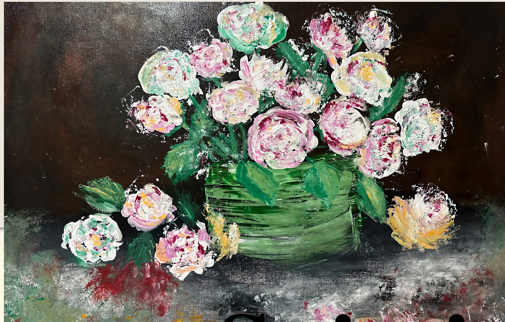
"Spring is gone" 45x60 Oil on Canvas

In Spring is gone , a vase of white flowers stands out against a dark background—deep, but not entirely black—like a dusk that still holds traces of fading light. Some flowers remain standing, while others have fallen, evoking the end of a cycle, fading beauty, and the quiet trace of time passing.